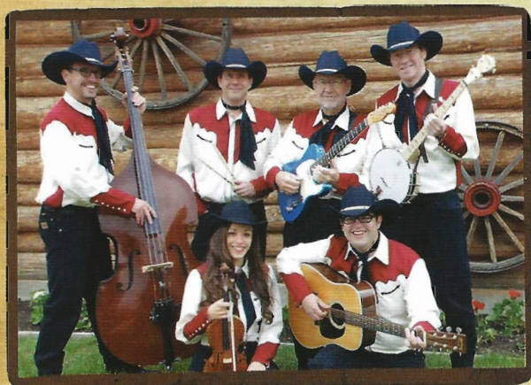
The Coal Diggers use D'Addario and Jagwire Strings exclusively